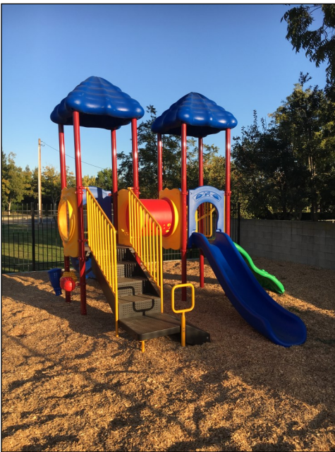
Left and middle: The playground and fence installation is completed.