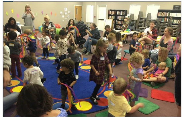
Right: "Mornings with Mommy" enjoyed a great many moms and toddlers participating.